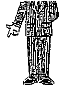
UNIT 5 - JAPANESE STAGE A